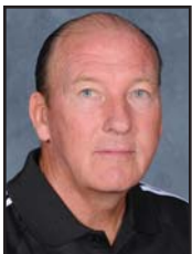
MIKE DUNLEAVY GENERAL MANAGER AND HEAD COACH

Mike Dunleavy begins his second season in the dual-role of General Manager and Head Coach and seventh season as the head coach of the Clippers. Dunleavy is now the third most tenured of all active coaches in the NBA, trailing only Utah's Jerry Sloan and San Antonio's Gregg Popovich. Despite a difficult 2008-09 season that saw the Clippers lose the fourth-most games to injury and illness in the NBA (233 games), Dunleavy helped develop a group of promising young players, including guiding first round selection Eric Gordon to become one of the most exciting rookies in the league in 2008. Long known as one of the hardest working and most dynamic coaches in the league, Dunleavy overhauled the Clippers roster prior to the start of the 2009-10 season with the additions of consensus collegiate player of the year Blake Griffin, swingman Rasual Butler, point guard Sebastian Telfair, and forwards Craig Smith and Mark Madsen. Dunleavy became the