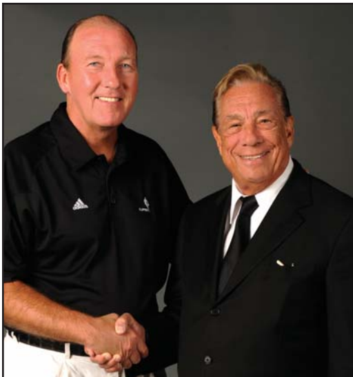
(L-R) Clippers' General Manager and Head Coach Mike Dunleavy and Donald T. Sterling

Sterling is the managing partner of a law firm and Chairman of Sterling Properties. He and his family reside in Beverly Hills and Malibu.